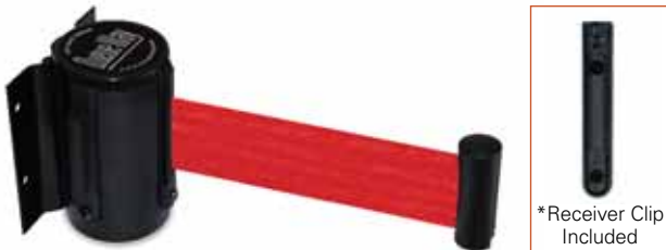
*Receiver Clip Included