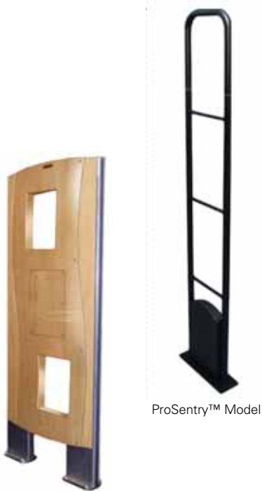
Insight™ RFID Detection System

Call our projects department at 1.800.268.2123 for details and current pricing.